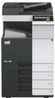
ineo+ 368 with dual scan document feeder (DF-704), output tray (OT-506) and paper feeder (PC-210)

Invest in an ineo+ 368 and you will no longer be dependent on external shops for specialist jobs such as invitations printed on thick, high-quality paper. That will save you time and money. The ineo+ 368 can handle envelopes, recycled paper, pre-printed paper, overhead transparencies, many other media and even thick card of up to 300 g/m 2 . These systems can print broad range of paper formats from A6 to A3+ (SRA3) or user-defined formats and banners of up to 1.2 metres in length. What's more, the numerous finishing options allow booklets of up to 80 pages to be created, letters folded in various ways, hand-outs stapled or invoices hole-punched. Almost any job can be produced in-house on an ineo+ 368.