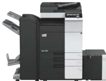
ineo+ 368 with dual scan document feeder (DF-704), staple/booklet finisher (FS-534SD), large capacity tray (LU-302) and paper feeder (PC-410)