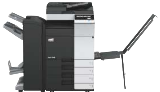
ineo+ 368 with dual scan document feeder (DF-704), staple/booklet finisher (FS-534SD), banner tray (BT-C1e) and paper feeder (PC-210)