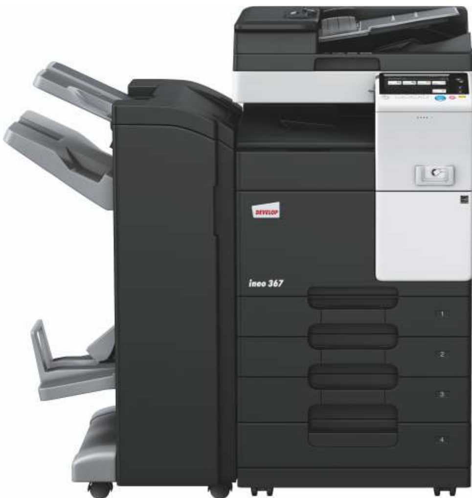
ineo 367 with document feeder (DF-628), staple/booklet finisher (FS-534SD), paper feeder (PC-213) and mount kit for local ID card authentication device (MK-735)

Job centres, schools and universities, engineering firms, architect's offices, insurance companies, banks, libraries: many small to mid-sized businesses or organisations don't really need colour printing capabilities. What their users really require is a monochrome multifunctional device that is intuitively easy to use and offers simple mobile usability for the increasing number of mobile office workers.