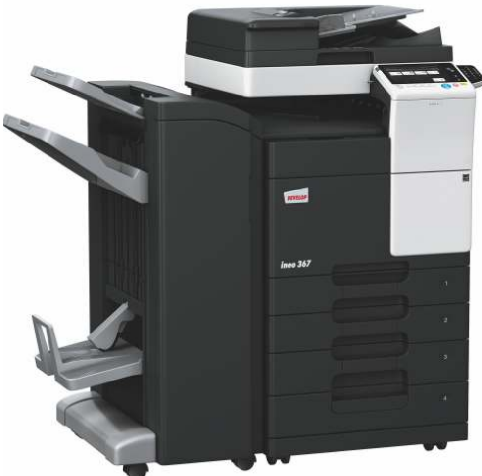
ineo 367 with document feeder (DF-628), staple/booklet finisher (FS-534SD), paper feeder (PC-213) and 10-key pad (KP-101)

The monochrome devices features a variety of energy-saving functions that cut power consumption. Besides saving you money, these green features are also good for the environment – and your carbon footprint.