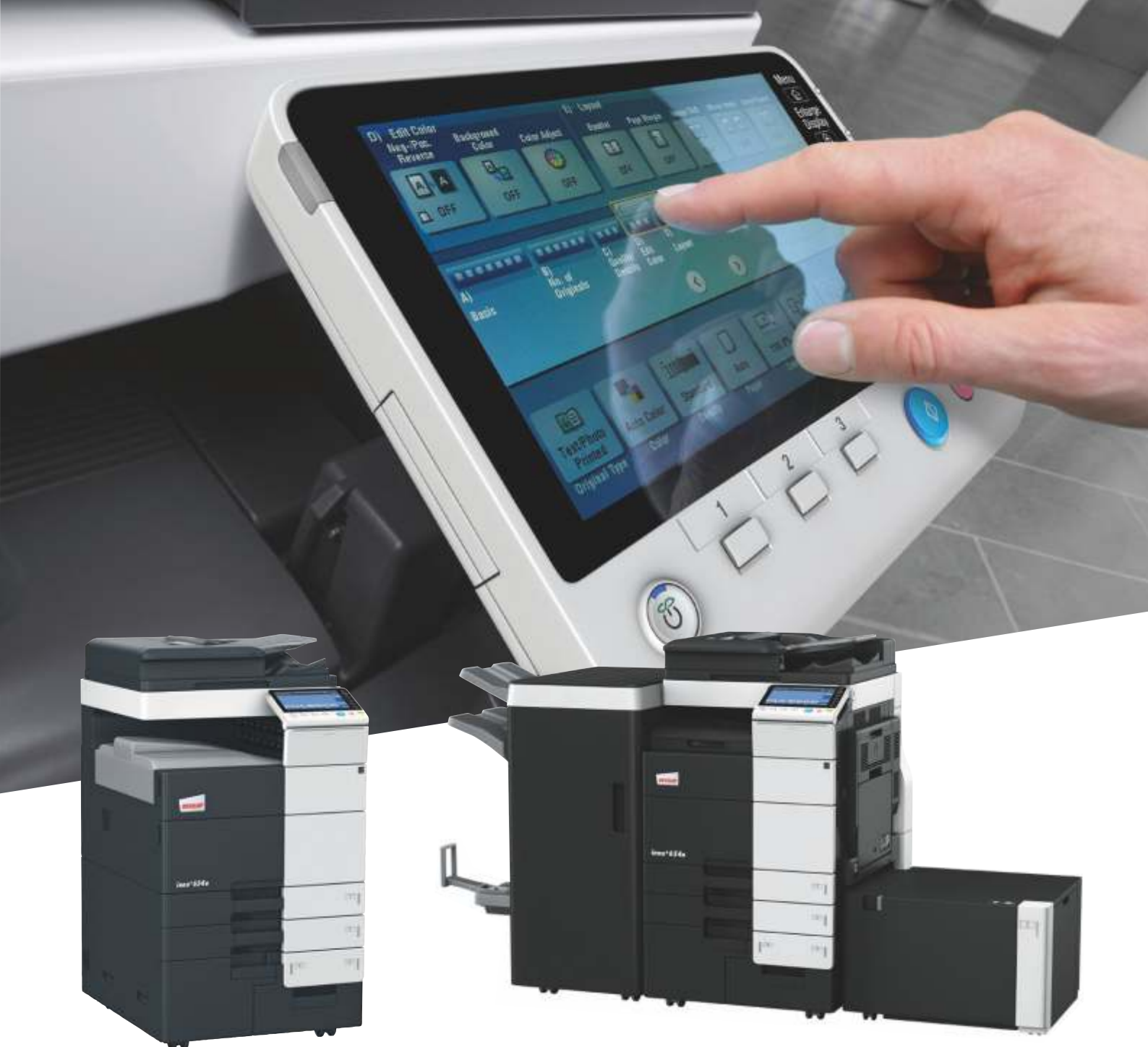
ineo+ 654e with output tray (OT-503)