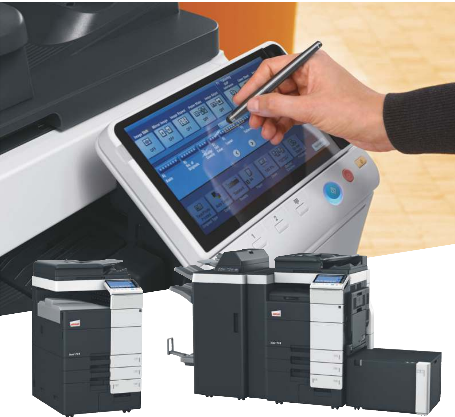
ineo+ 754 with output tray (OT-503)