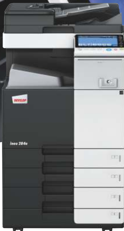
ineo 284e with dual scan document feeder (DF-701), paper feeder (PC-210) and working table (WT-506)