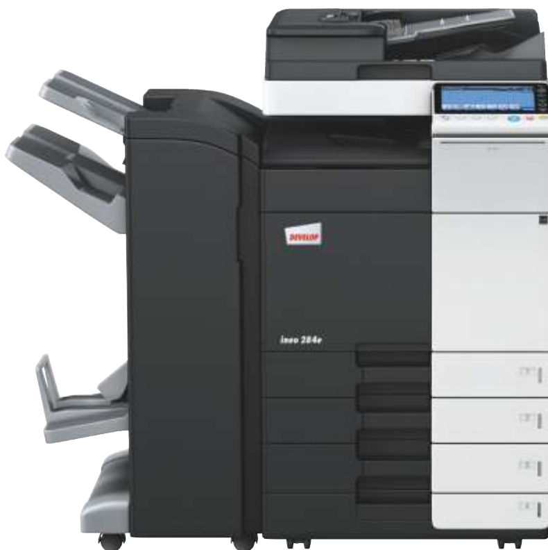
ineo 284e with dual scan document feeder (DF-701), staple/booklet finisher (FS-534SD) and paper feeder (PC-210)

Each of these multifunctional office devices – the ineo 224e, ineo 284e, the ineo 364e, the ineo 454e and the ineo 554e – is not only remarkably easy to use but also offers a wide variety of features to facilitate everyday office tasks. By saving office users time in printing, copying or scanning, they can return to their normal work faster. And that will ultimately help boost productivity.