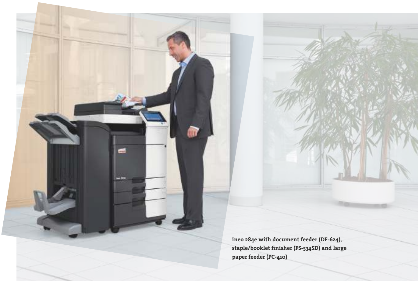
ineo 284e with document feeder (DF-624), staple/booklet finisher (FS-534SD) and large paper feeder (PC-410)

These black-and-white systems come with a number of energy-saving features that cut power consumption by over 40% compared to predecessor models. While this kind of economy saves money, other green features are ecologically beneficial. And that means DEVELOP's ineo e line-up is not only good for the environment but also boosts the owner's green credentials.